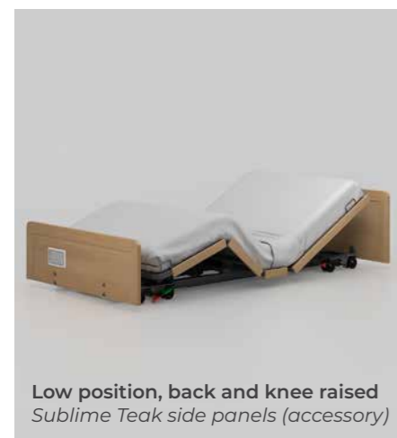
Low position, back and knee raised Sublime Teak side panels (accessory)