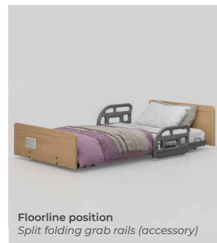
Floorline position Split folding grab rails (accessory)