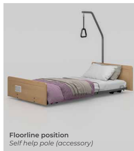
Floorline position Self help pole (accessory)