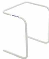
Fixed Height Bed Cradle BEA014605