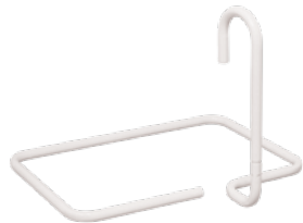
Bed Pole With Adjustable Crook Handle BEA014150