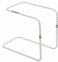
Adjustable Height Bed Cradle BEA014610

*Only fits community beds with a side frame thickness of at least 50mm