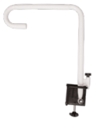
Clamp On Bed Pole BEA009300 & BEA009310

*Only fits community beds with a side frame thickness of at least 50mm