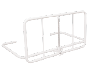
Drop Down Bed Rail BEA013700