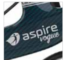
Signature Carbon Fibre Weave